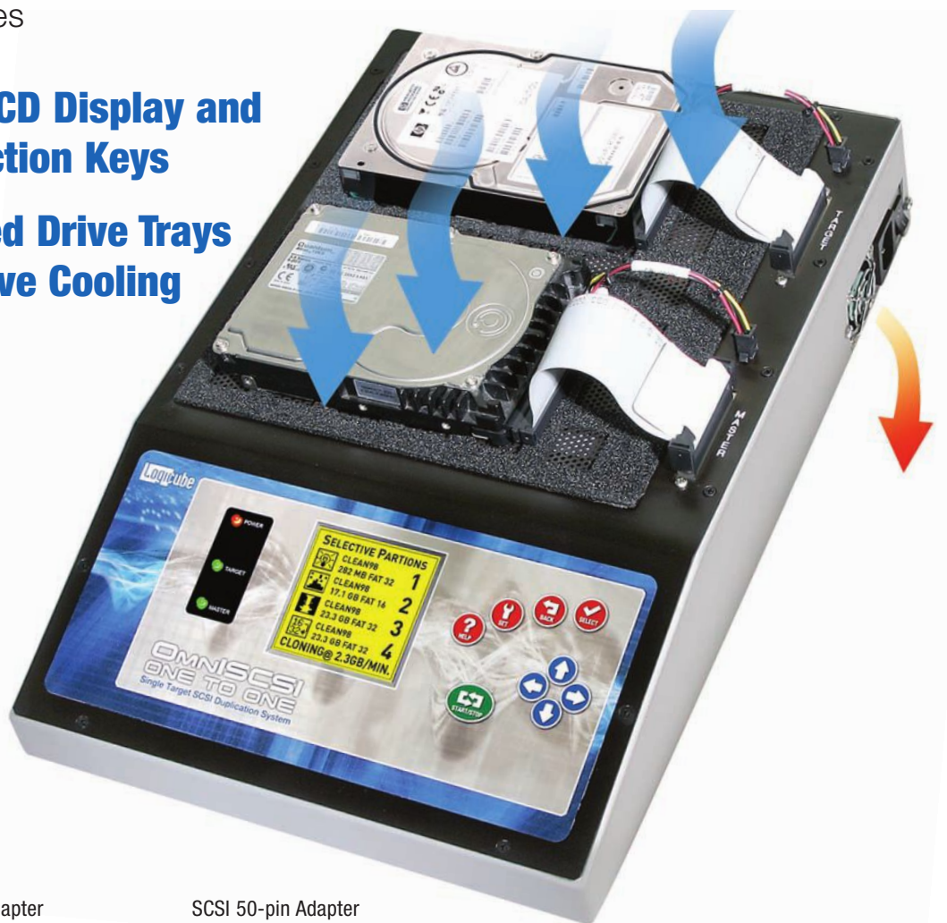
SCSI 80-pin Adapter

Perforated Drive Trays with Active Cooling